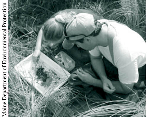
Scientists with the Maine Department of Environmental Protection sample macroinvertebrates to test wetland condition.

Often, the most direct and effective way of evaluating the ecological condition of a wetland is (1) to directly measure the condition of the wetland's biological community and (2) to observe and measure the chemical and physical characteristics of a wetland and its surrounding landscape.